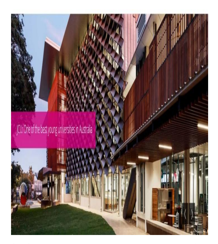
Conference website: https://www.jcu.edu.au/college-of-healthcare-sciences/research/ausasian-mental-health-researchgroup/2019-aasp-small-group-conference

29, 2019 at the beautiful Townsville Campus of James Cook University, Australia. You can also join the conference at JCU Cairns campus, Australia or JCU Singapore campus via video conferencing. The Small Group conference is co-hosted by the Department of Psychology, and the AusAsian Mental Health Research Group (AMHRG), JCU. The Organizing Committee cordially invites researchers working in tropical areas in the Asia-Pacific region to attend the meeting.