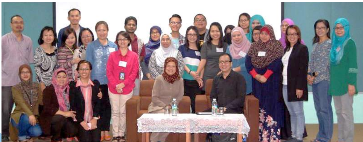
Group photo of participants in Kota Kinabalu, Sabah, Malaysia AASP Publication Workshop

There has been a remarkable growth in social psychology publications from Asian authors in the