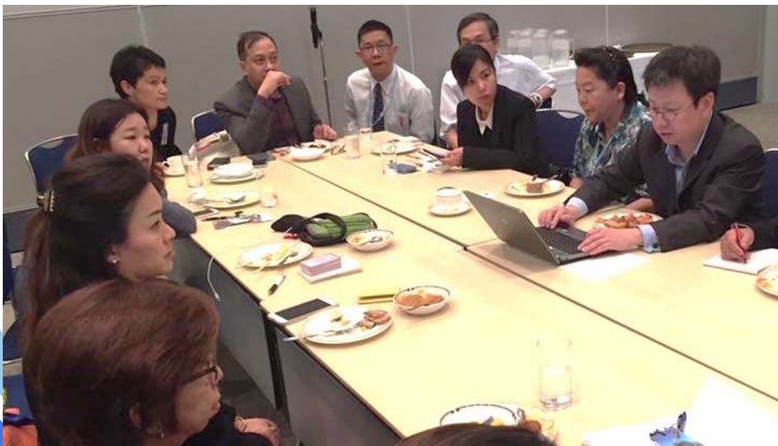
AASP participated in Asia-Pacific Psychology Leaders Forum in Yokohama Japan, July 2016