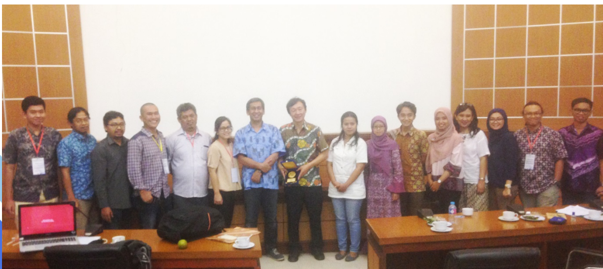
From Action to Publication, workshop manuscript publication in Bali

13 university teaching staffs with social psychology as their specialization