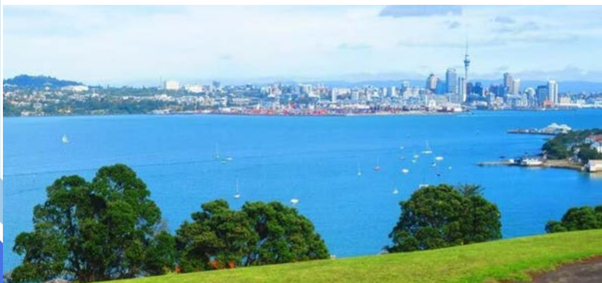
Auckland, New Zealand

prior to the main conference to allow delegates to spend some more quality time in New Zealand. The deadline for conference submissions is January 31, 2017, so start making your submissions now. We promise to respond promptly with decisions on acceptances in advance of the final deadline.