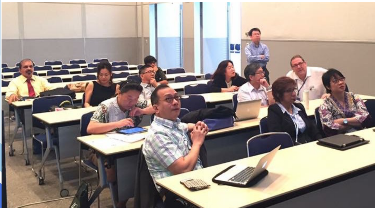
AASP participates in drafting of resolution to form the Asia-Pacific Psychology Alliance

associations who participated in the meeting, the other participants being representatives of national psychology organizations from about 15 Asian and Pacific Countries. During the meeting it was resolved that an alliance of Asian psychology associations will be formed to work towards greater cooperation within the region to advance the goals of psychological science and practice. The resolution was signed during the Assembly of the IUPsyS, and although the AASP was not a signatory because the AASP is not an affiliate of the IUPsyS, the AASP will be part of the continuing discussions and work of this alliance. During the discussions, I shared AASP's experience in trying to strengthen scientific research and publication in social psychology, and the other members of the alliance seem eager to learn from AASP's work in the region related to this important thrust of the alliance. More importantly, I hope that AASP's participation in the alliance