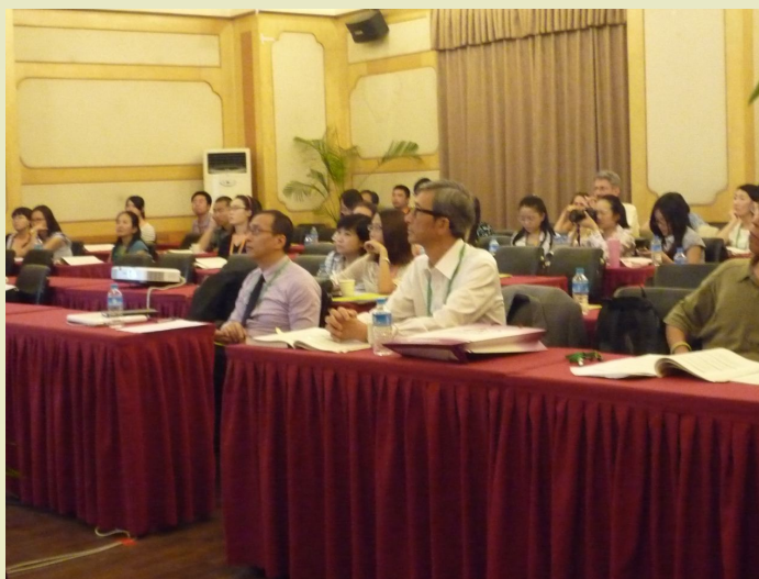
IALSP-Sponsored Symposium at KunMing

More information: http://www.ialsp.org/index.html