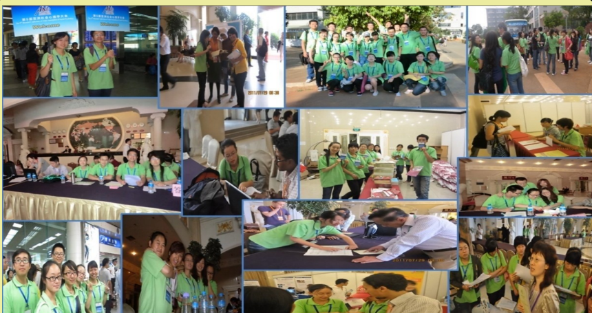
Volunteers on the conference

School of Psychology, Beijing Normal University, China